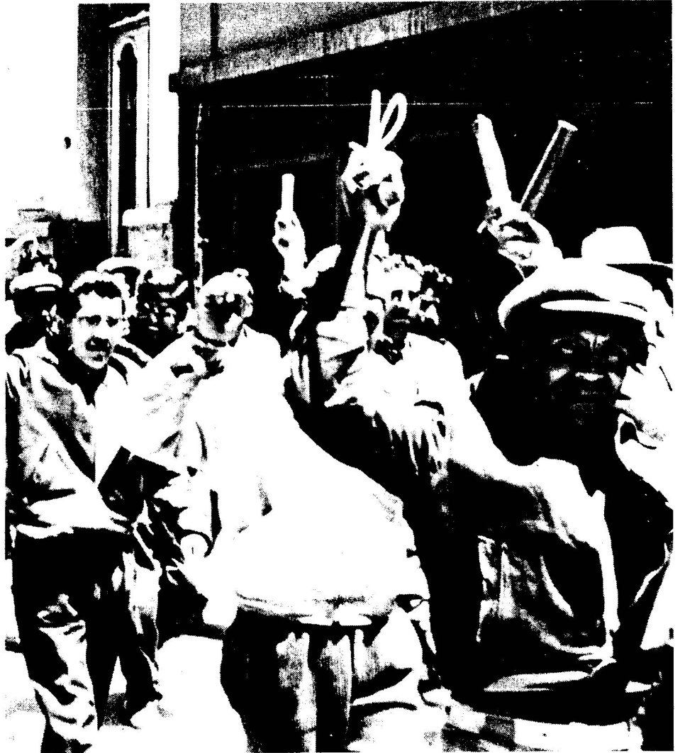
BOLIVIAN MINERS MARCH WITH DYNAMITE

Young workers, militants of the SWP-YSA, JOIN THE FIGHT FOR THE DELEGATION OF THE RWY TO THE WORLD CONGRESS OF THE REVOLUTIONARY YOUTH INTERNATIONAL!!! CONTRIBUTE! JOIN THE REVOLUTIONARY WORKER YOUTH!!